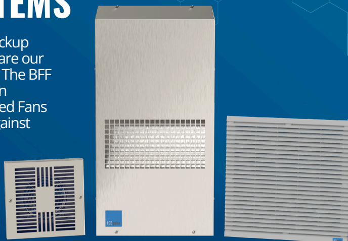
Metal Filtered Fans (FP Series)