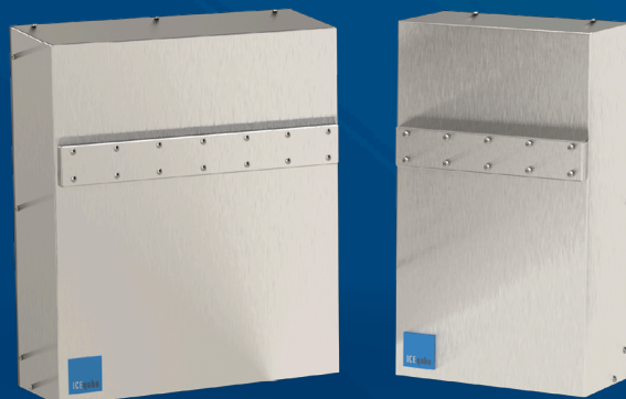
Washdown Filtered Fans (FPW Series)